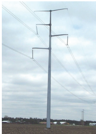
Single circuit single pole structure