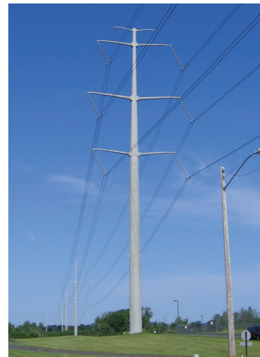
Double circuit single pole structure