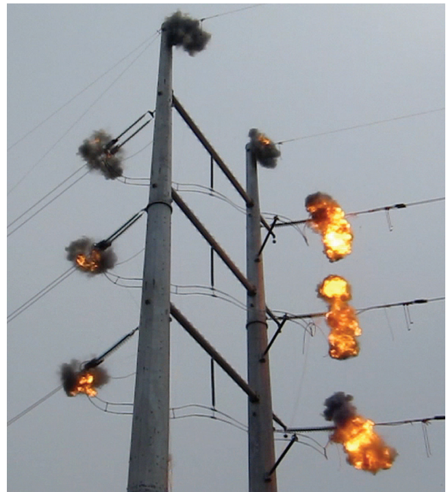
The split-second detonation of implosive connectors creates a flash and a loud boom.