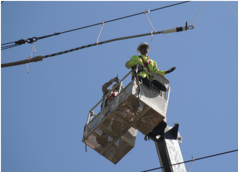
Workers prepare an implosive connector for detonation.