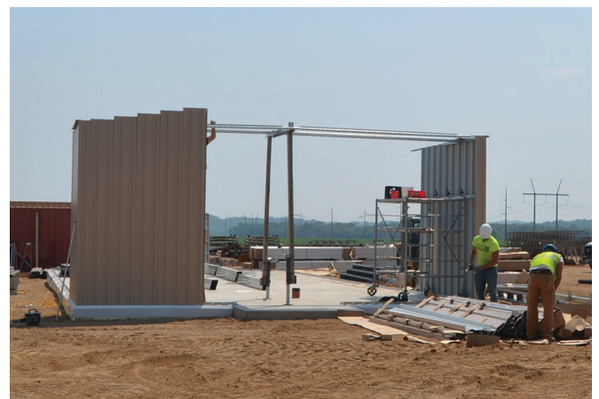
Crews working on the control house at the new North Rochester substation outside Pine Island.

The Hampton, North Rochester, Northern Hills and Briggs Road substations are currently under construction.